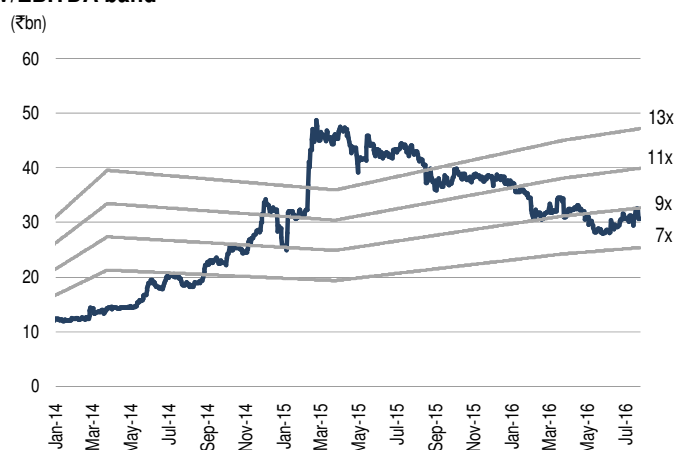
Fig 9 – EV/EBITDA band

We value the stock at 9x FY18e EBITDA. The target EV/EBITDA multiple is higher than its peers as the company operates in a high-growth market and commands superior margins. The stock trades at an EV/EBITDA of 7.7x and an EV/ton of $146 on FY18e.