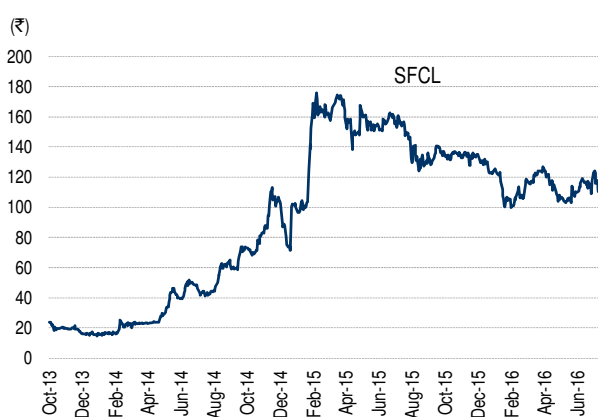
Fig 5 – Price movement